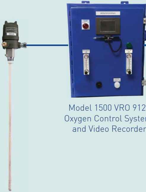
Model 1500 VRO 9120 Oxygen Control System and Video Recorder